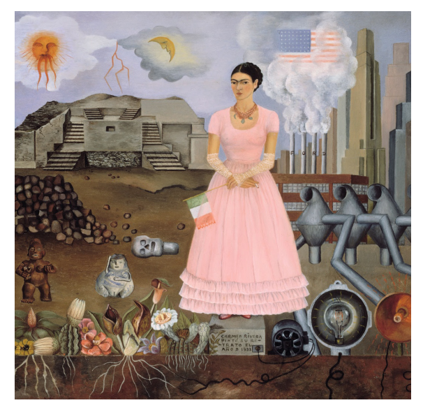
Figure 3: Self-Portrait Along the Borderline between Mexico and the United States ( Frida Kahlo, 1932 ).

imply the idea of learning with American Progress to foster students' visual literacy. Students not only learn about the country's cultural, social, and linguistic diversity but also about the near extinction of Native Americans, the colonial (dis)empowerment and the downsides of 'progress' such as the disadvantages of industrialization and unlimited growths. For each phase of a lesson, a method is introduced that picks up the painting's content in a meaningful and communicative way to foster the students' visual literacy.