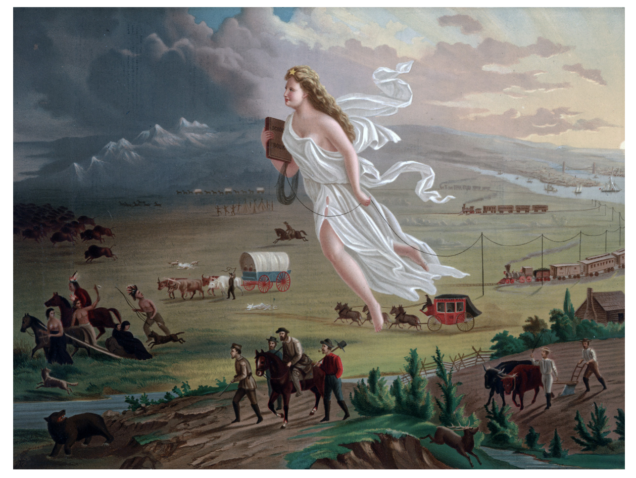
Figure 2: American Progress (John Gast, 1872).

Gast's painting from 1872 emerged during a period which was marked by technological innovation and a continuous industrialization in the United States. Concomitant with these two aspects came a switch from being a predominantly agricultural nation to a focus on manufacturing and urbanization. These drastic changes brought along new modes of transportation, i.e., an elaborated and transcontinental railroad system,